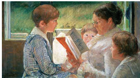
READING TO CHILDREN by Mary Cassat